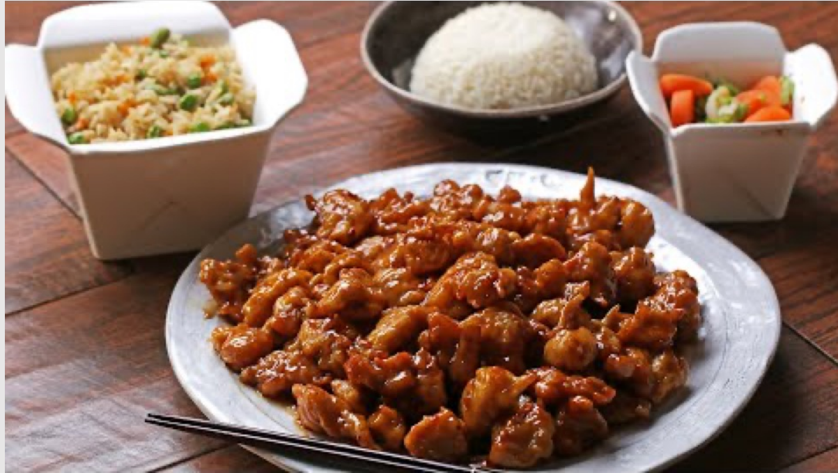
The Original Orange Chicken by Panda Express 11,171,239 views • Feb 28, 2018