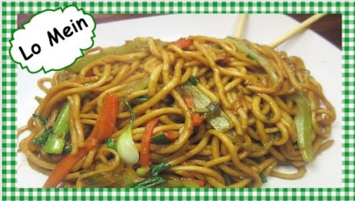
How to Make The Best Chinese Lo Mein ~ Chinese Food Recipe 6,647,325 views • Feb 12, 2016