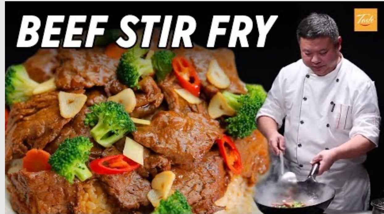
How to Cook Perfect Beef Stir Fry Every Time 3,147,257 views • Jan 25, 2019