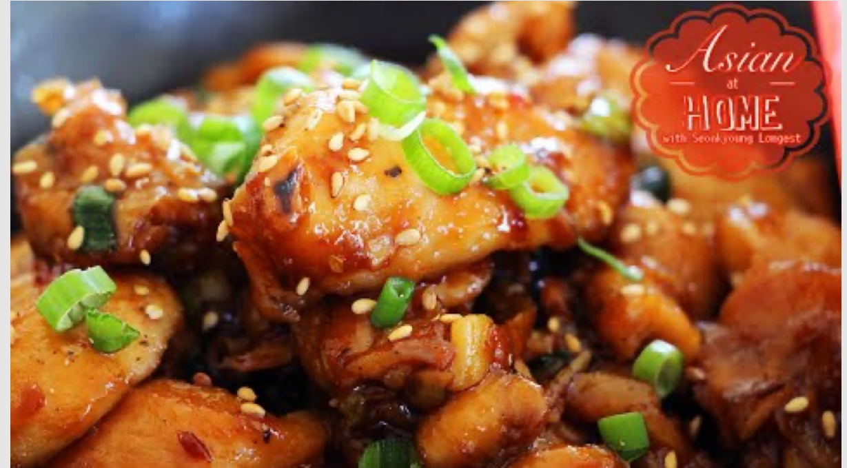
ASIAN AT HOME S5 • E4 Easy & Healthy Orange Chicken 1,147,962 views • Jun 4, 2015